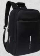
▲ COLOUR: Black