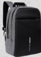
▲ COLOUR: Grey