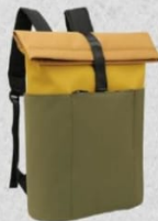
▲ COLOUR: Olive