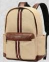
▲ C010103 Vanilla Sand