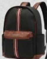
▲ C010102 Stark Black