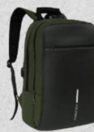
▲ COLOUR: Green