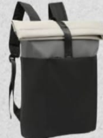
▲ COLOUR: Black