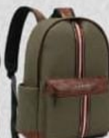
▲ C010105 Pocket Sage