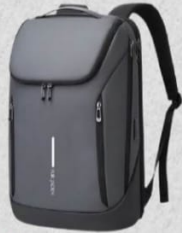
▲ COLOUR: Brown