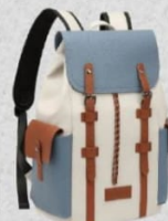
▲ COLOUR: Blue