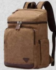
▲ COLOUR: Sand Brown