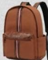
▲ C010104 Desert Dune