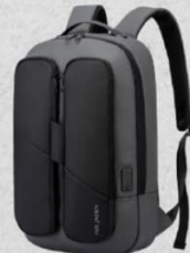
▲ COLOUR: Space Grey