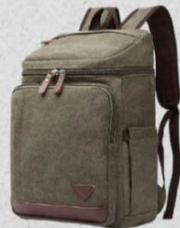
▲ COLOUR: Olive