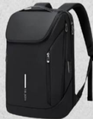
▲ COLOUR: Pine Green