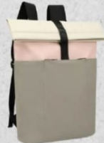
▲ COLOUR: Taupe