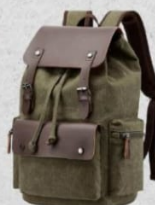
▲ COLOUR: Olive