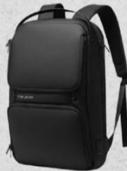
▲ COLOUR: Charcoal Black