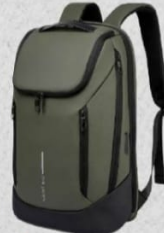
▲ COLOUR: Pine Green