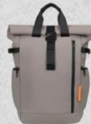
▲ COLOUR: Stone