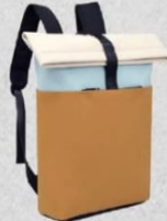
▲ COLOUR: Tan