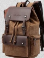
▲ COLOUR: Tawny Brown