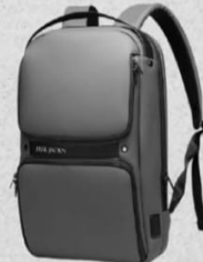
▲ COLOUR: Space Grey