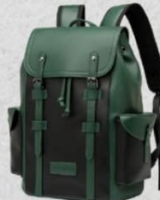
▲ COLOUR: Pine Green