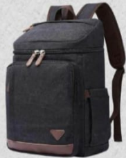
▲ COLOUR: Midnight