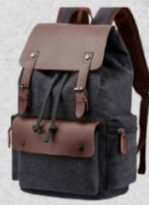
▲ COLOUR: Midnight Black