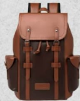
▲ COLOUR: Brown