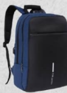
▲ COLOUR: Navy