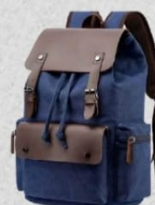
▲ COLOUR: Cobalt Blue