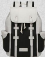
▲ COLOUR: Black