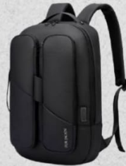
▲ COLOUR: Charcoal Black